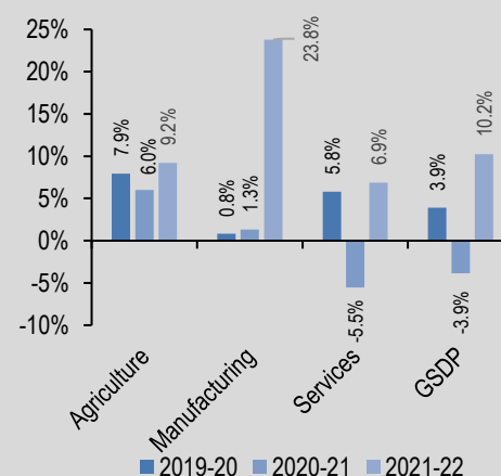
Figure 1: Growth in GSDP and sectors in Delhi at constant (2011-12) prices

Note: These numbers are as per constant prices (2011-12) which implies that the growth rate is adjusted for inflation.